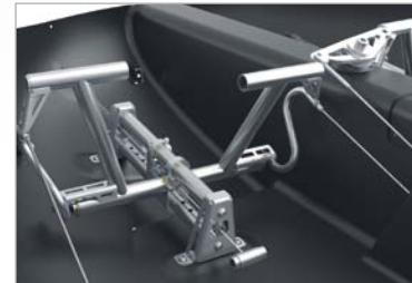
Individually adjustable: pedals can easily be adapted to the pilot's size.