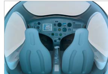
A new dimension: the Cavalon offers a huge interior.